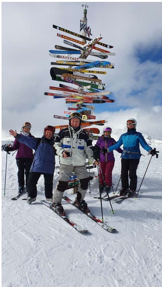
Every which way

As with a lot of Austrian resorts, Ischgl is a party town. It is quite easy to avoid the après ski bars if a