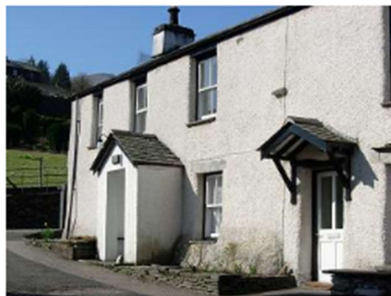
Low House and Cottage - Coniston

Hoping that we will be allowed to visit the mountains in the autumn, I have made a provisional booking for a weekend in the Lake District. What's been called the High Altitude Training Weekend has been run for many years as an opportunity to enjoy lead walks in the mountains, however there's no reason why members could not use this sociable event for mountain biking or enjoying being in the Lake District. I've made some provisional bookings for this year, returning to Low House, the Midland Association of Mountaineers' property in Coniston. This has bunk bed dorms of various sizes, but it's in the town conveniently placed for shops and pubs.