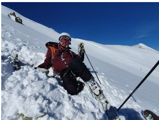
Gill goes off piste